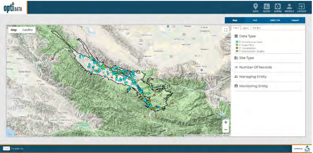
Figure 6-1: Screenshot of Opti Platform

The Cuyama Basin DMS uses the Opti platform, which is a flexible and open software platform that uses familiar Google maps and charting tools for analysis and visualization. The DMS serves as a data-sharing portal that enables use of the same data and tools for visualization and analysis. These tools support sustainable groundwater management and create transparent reporting on collected data and analysis results. Figure 6-1 is a screenshot of the Opti platform.