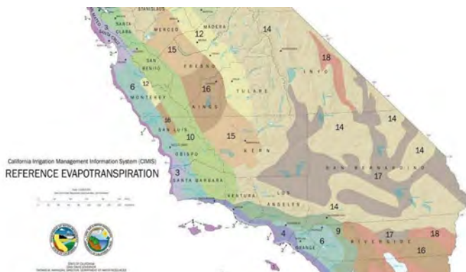
Avg Annual Reference ET by Zone (inches/yr)

The below values were calculated using ET reference averages for zone 10 from the Crop Report (see below figure).