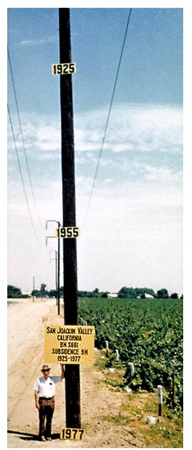
Figure 2: Subsidence Visualized