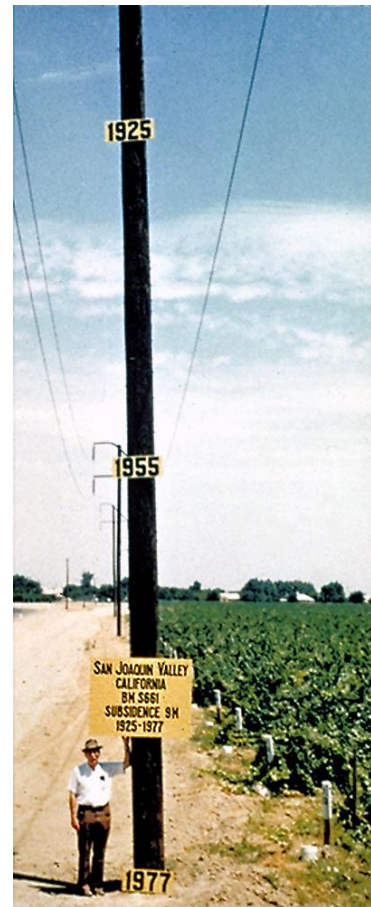
Figure 2: Subsidence Visualized

Clays and silts, such as those present in the Younger Alluvium, Older Alluvium, and Upper Morales Formations, generally have lower elastic capabilities, meaning they are not able to recover to their original volume once water has been removed. Once clays and silts are heavily compacted, they often cannot return to their previous saturation capacity even if groundwater levels are increased; this permanently reduces the storage capacity of the aquifer. This loss of aquifer is limited to the water that was stored in the compressed clays, with storage capacity loss limited to the water that was stored in clays that were compressed, which is reflected in the amount of subsidence measured. Water stored in clay materials is generally not available for use by wells.