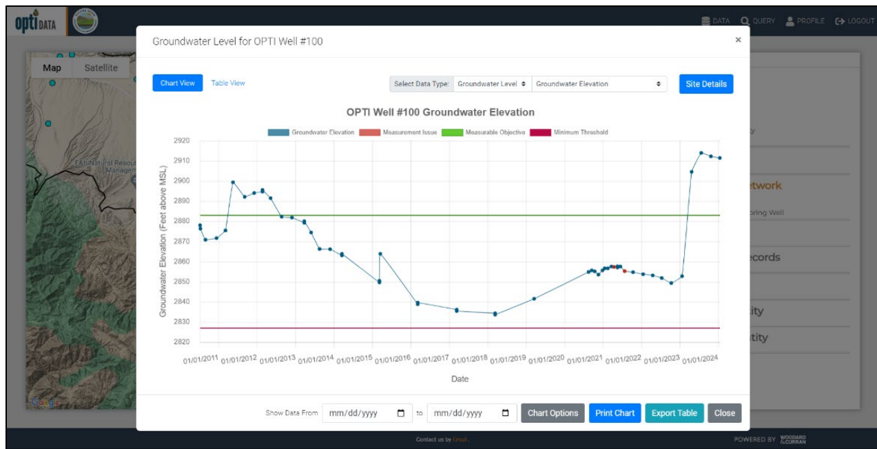
Figure 6-4: DMS Map View

filtered by different criteria, such as number of records or monitoring entity. Users may click on a site to view the site detail information and associated data. The monitoring data records are displayed in both chart and table formats. In these views, the user may view different parameters for the data type. The chart and table may be updated to display selected date ranges, and the data may be exported to Microsoft Excel.